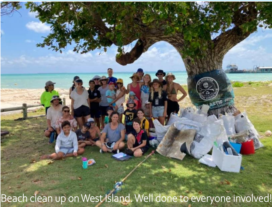
Beach clean up on West Island. Well done to everyone involved!