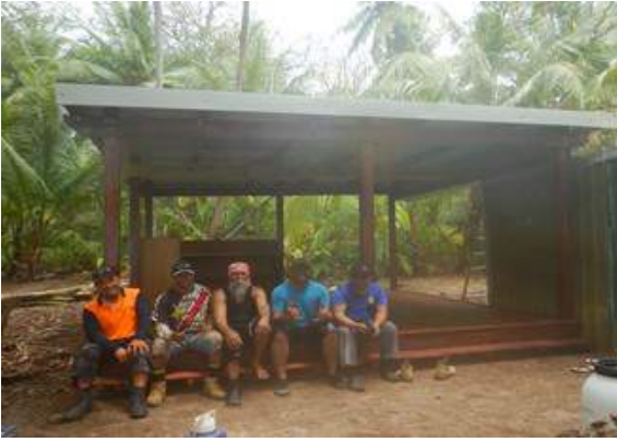
North Keeling Shelter constructed by the Cooperative.