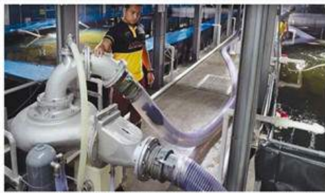
Apollo Aquaculture Group (AAG) in Singapore is building an eight-story RAS in the city-state in order to produce grouper and shrimp.

Dr Goh stated that for aquaculture projects in Singapore, seawater had to be bought, where as on the Cocos (Keeling) Islands it was free.