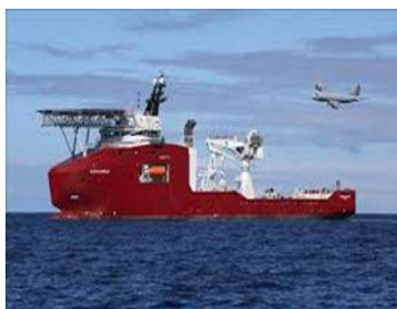
ADV Ocean Protector

Kongsi mengadakan servis ground handling untuk Cobham di bulan February 2020 yang melibat pertukaran crew dan menambah keperluan untuk ADV Ocean Protector.