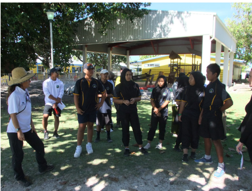
CALOPHYLLUM INOPHYLLUM POKOK NYAMPLONG