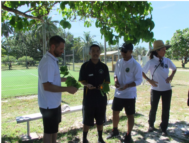
CORDIA SUBCORDATA POKOK GERONGGANG

Trish, Siddiq and Scott from Parks Australia educating CIDHS students on some of the native trees.