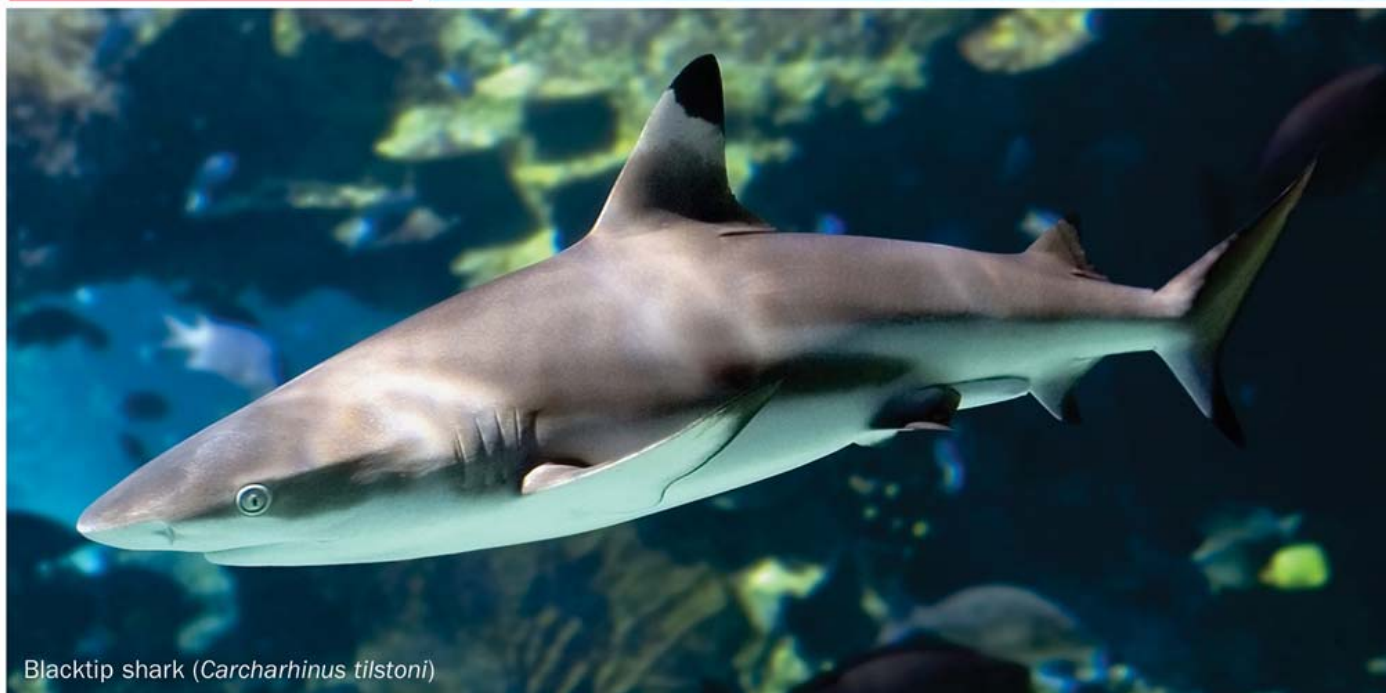
Blacktip shark ( Carcharhinus tilstoni )

Reef sharks inhabit tropical waters and lagoons near coral reefs in Indo-Pacific waters and the Caribbean. There are several different types of reef sharks in the world however only the white- tip, black-tip, and grey reef sharks are found in the waters of the IOTs.