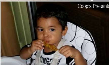
Coop's Presentation Night