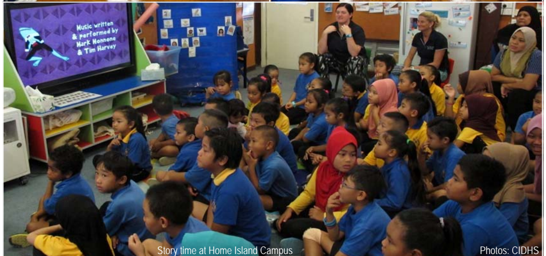
Story time at Home Island Campus