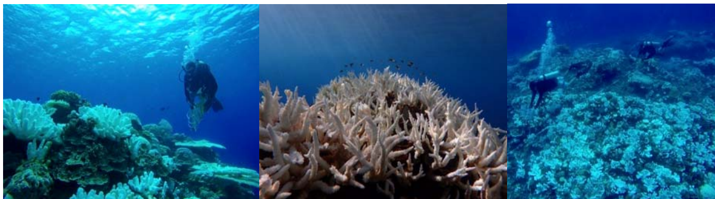
Images: Christmas Island May 2016. Department of Fisheries Western Australia

References: (1) www.globalcoralbleaching.org (2) www.sciencemag.org - 19 th April 2016