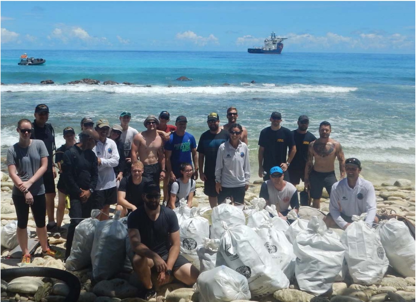
Many thanks to Australian Border Force and the Ocean Shield who joined Parks Australia for a recent beach clean up at Pulu Keeling National Park.

Do you have a Cocos Moment you would like to share?