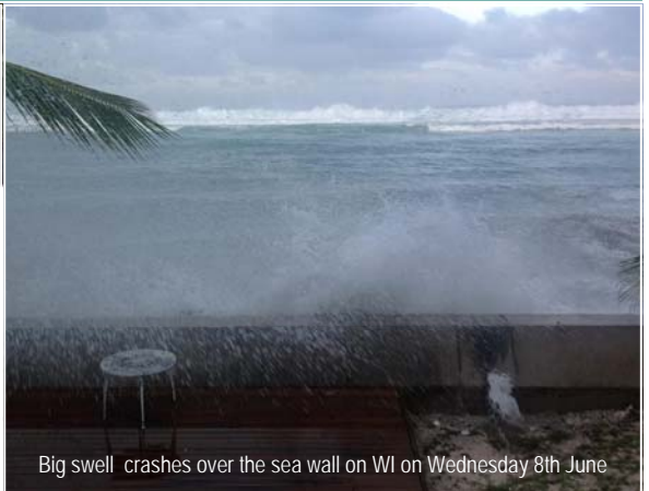
Big swell crashes over the sea wall on WI on Wednesday 8th June