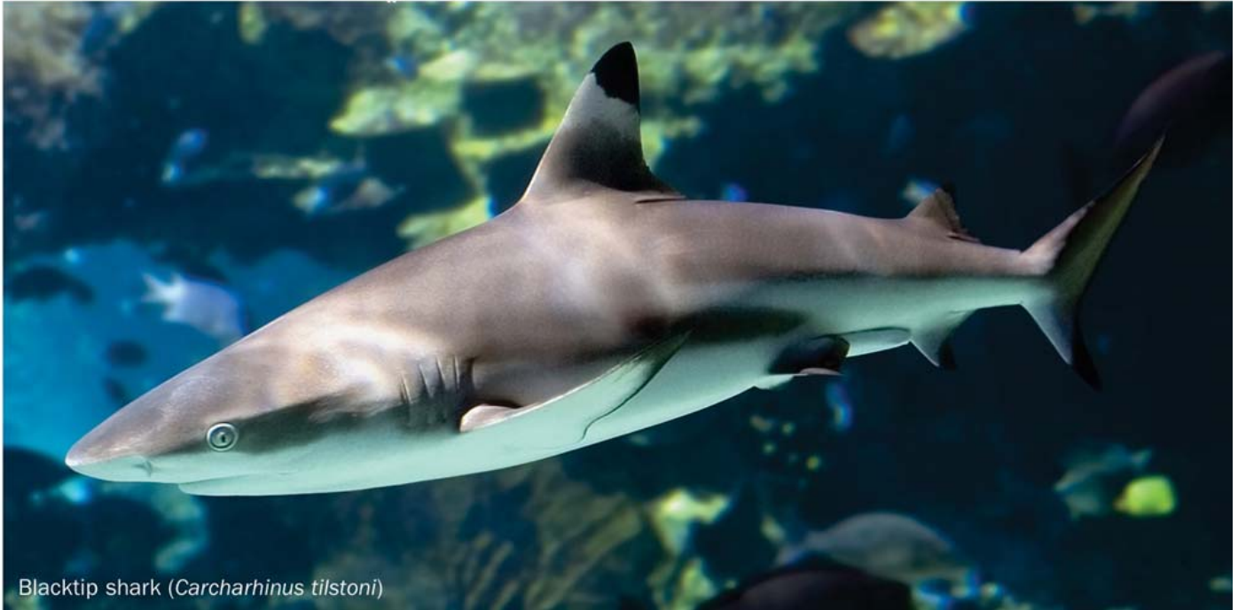
Blacktip shark ( Carcharhinus tilstoni )

Cucut tinggal dilautan tropikal dan lagoon dekat batu-karang di lautan Indo-Pacific dan Caribbean. Ada beberapa jenis cucut didalam dunia tetapi hanya cucut batu, cucut black-tip dan cucut hitam yang didapati dilautan IOTs.