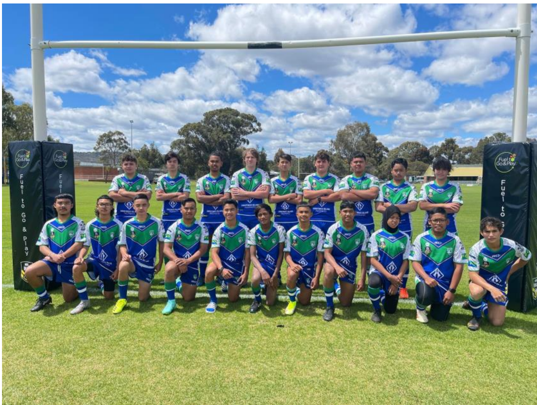
Congratulations Indian Ocean Territories Rugby League Club!